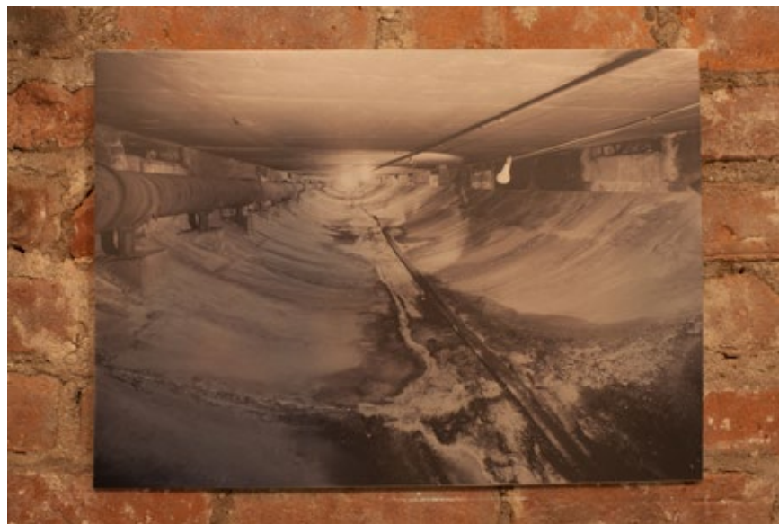
Ventilation Building: Holland Tunnel, inkjet print, 17.5 x 10.5 in, printed 2015