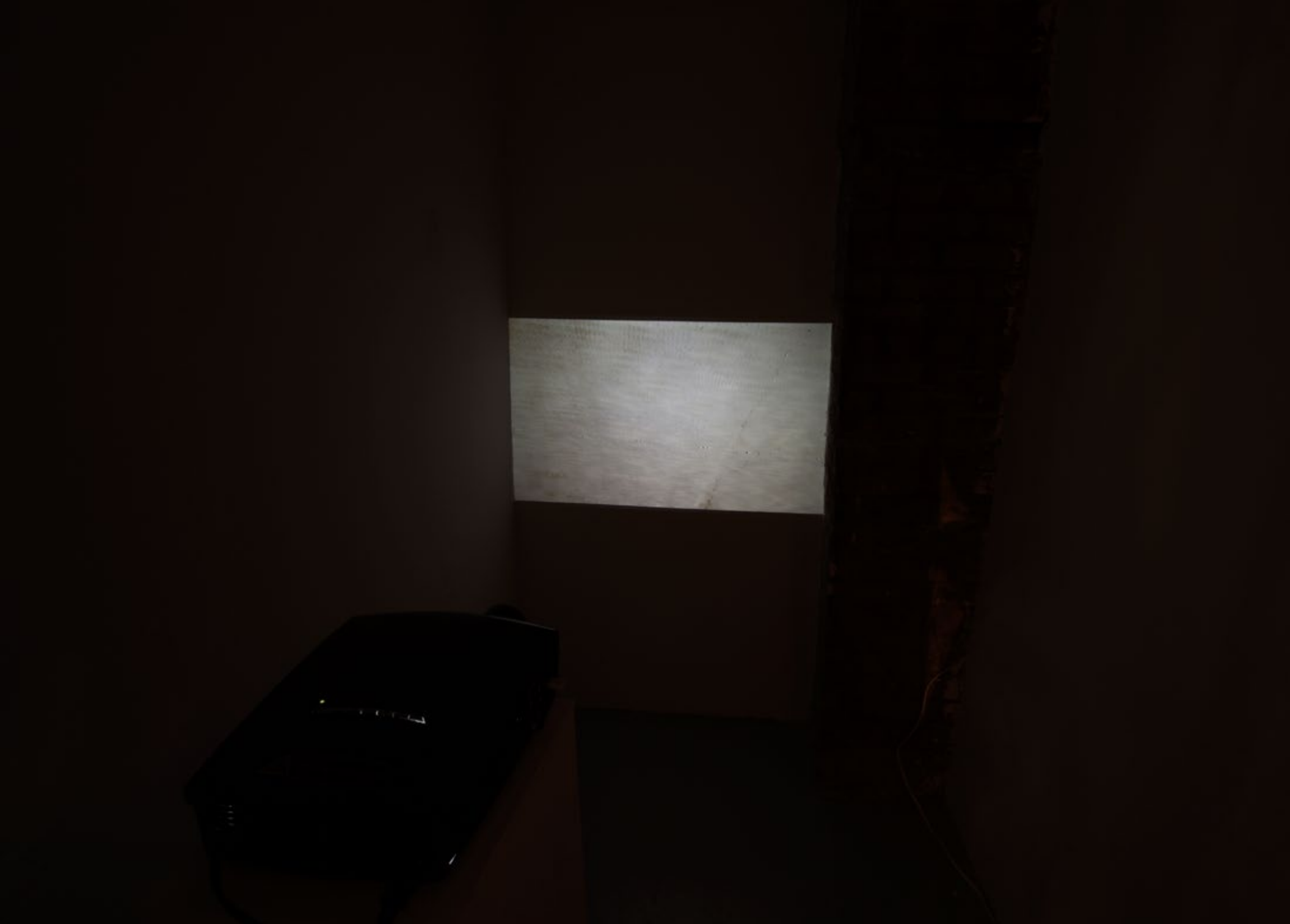
Little By Little There Was No There Only Elsewhere, video loop, 6:00, 2015