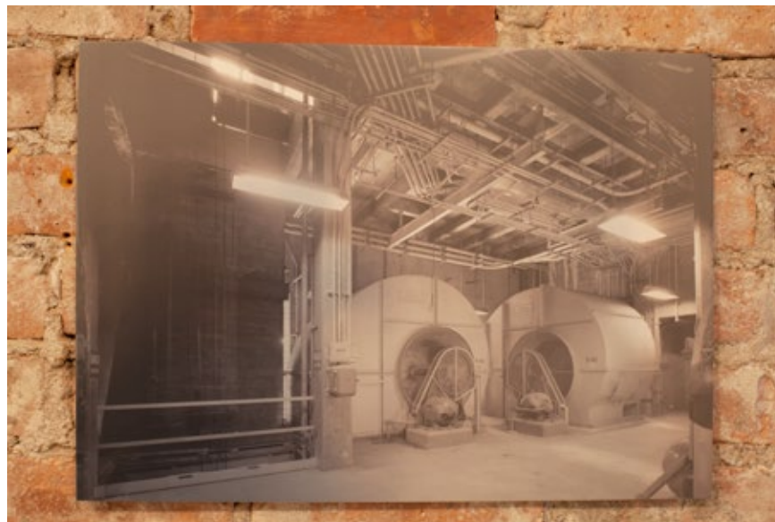
Air Supply: Holland Tunnel, inkjet print, 17.5 x 10.5 in, printed 2015