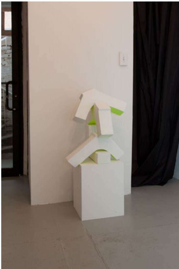
When Something Happens Nothing Begins, foam, plaster, paint, 2015

February 13-March 22 191 Henry St. New York, NY